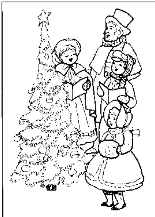
sketch from the December 1969 Spy Does anyone know who the artist is?

outstanding display of handmade creations at the Van Dyck by area artists include wreaths, pottery, candles, jewelry designs, knitwear, stained glass, wood designs and much more.