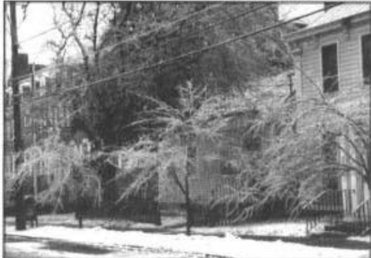
Ice Blossoms on Wash. Ave. Dec. Storm

Family & Child Service urges the public to join in this effort by bringing non-perishable food items of all kinds to 246 Union Street (across from the Van Dyck), throughout the month of February, Monday - Friday, between the hours of 8 am - 4 pm. Donations will be distributed to needy clients in the FCSS Medicaid Services Coordination program, which serves families with a developmentally disabled child or youth; to low-income seniors through the B'nai B'rith (continued on page 2)