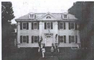
Longfellow Home 1759

While visiting family in the Boston area last summer I came upon the Longfellow National Historic Site, home to Henry Wadsworth Longfellow in a quiet, unassuming neighborhood in Cambridge, Massachusetts, a stone's throw away from the Charles River. What gave it a second look was the fact that it resembles the Schenectady County Historical Society's home on Washington Avenue in the Stockade. Longfellow's home is a Georgian Mansion ca. 1759 and the Historical Society is also Georgian but, with aspects of Federal and Greek Revival. What's most striking is the front entrance of the county building at 32 Washington Avenue which is a more ornate entrance than the Longfellow House. If you look above the two entrances you can see immediately the more toned down front door of the Longfellow home. Also, its roof has two end windows while the Historical Society's has one, above its front entrance. The Historical Society's building was built in 1895 which is a lot younger than Longfellow's 1759 structure. Although the age difference, both structures are similar in design and purpose for both are now museums that house priceless artifacts, books, artwork and period furniture. So "famous" was this "outstanding example" of mid-Georgian architecture that it's been replicated a great deal throughout many parts of the country.