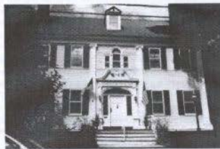
Schenectady County Historical Society 1895

Summer is upon us and, once again, in the northeast, it is time to hit the road for another day trip. Happy travels.