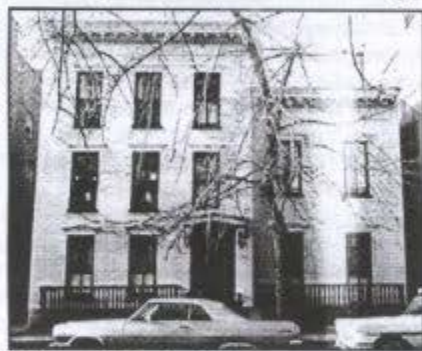
#7 Union St. in the 1960's