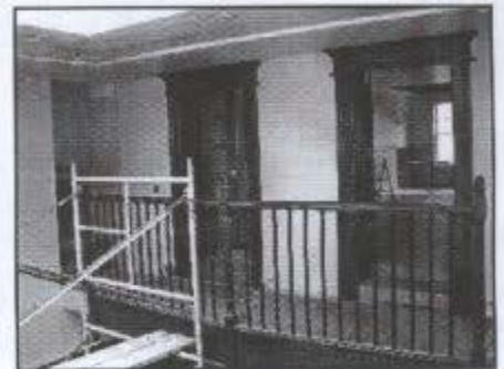
Second floor balcony looking into main entertainment area

The new black awning with gold lettering will be a fitting welcome for the "Early Hollywood" themed Soiree guests September 13, as well as heralding the Van Dyck as the "gateway to the Stockade and a bridge from downtown."