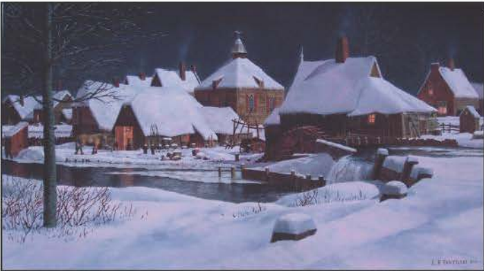
Schenectady Town by Len Tantillo, 2005

With coordination through the City of Schenectady Heritage Area Schenectady/Nijkerk Council, the Community Archaeology Program of Schenectady County Community College, the Schenectady County Historical Society, the Stockade Association and First Reformed Church of Schenectady are several of the community organizations planning the range of activities to take place during Schenectady's 2011 Colonial Festival.