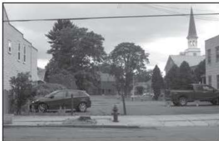
Green Street - Before Restoration

The Stockade Association generously provided $1,000 toward the $4,000 project. Working together, Schenectady Heritage Foundation, the Stockade Association and First Presbyterian Church, have preserved the fence and greatly improved that section of Green St. for the enjoyment of the neighborhood and its visitors.