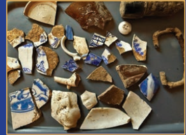
Artifacts unearthed at 205 Union St.